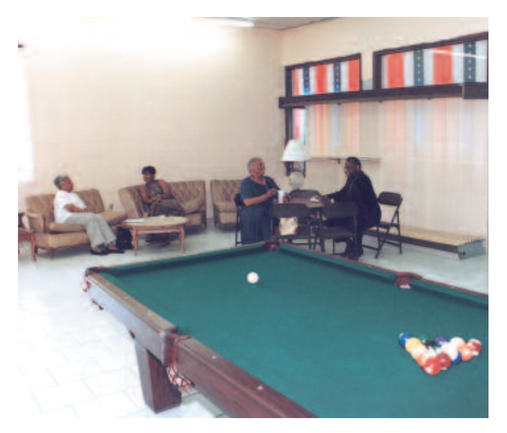
Remodeled and furnished, the Mall's Senior Community Center awaits funding for staff and programming costs.

The Mall's impact on its community's quality of life increases as it continues to operate. However, its costs of operation are substantial. Assuring the Mall's future and its positive influence on community economics is essential to its ability to anchor an economic resurgence in the area.