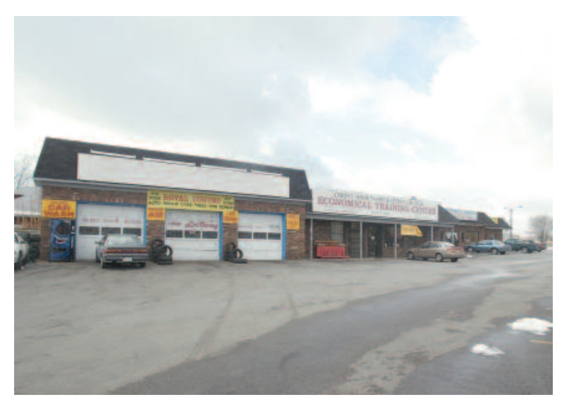
Your support for Christ Missionary Mall touches many lives.