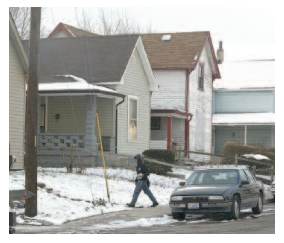
Christ Missionary Mall provides vital direct and indirect services to a challenged neighborhood and its residents.

Within a neighborhood in which many residents lack reliable transportation and struggle to support themselves on low-income wages,